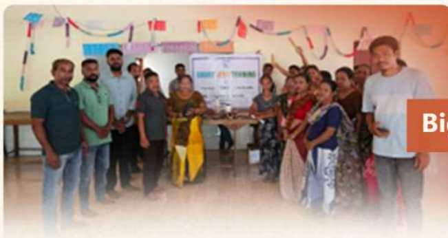
Big Lapathy Village, Car Nicobar

A weeklong short-term training programme on coconut shell handicrafts was organized by the Industries Department from 28 July 2025 for tribal beneficiaries of Big Lapathy Village, Car Nicobar , with the objective of skill development and livelihood promotion.