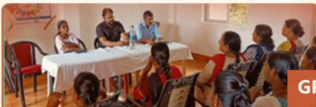
GP Chainpur and GP Pahalgaon

An Awareness-cum-Motivational Programme on PMEGP, Udyam Registration, NSWS, and other government schemes was organized by the District Industries Centre on June 6, 2025, at the Community Hall, Buniyadabad, in collaboration with the Industries Department, PRIs, and JSS-NGO.