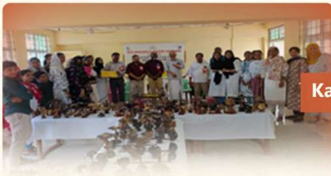
Kanyapuram Gram Panchayat

The Industries Department organized a 15-day short-term skill development training programme on handicrafts —focusing on coconut shell, wooden, and cane & bamboo products—at Kanyapuram Gram Panchayat from 16 April to 5 May 2025 , engaging 35 participants and aiming to promote self-employment and strengthen the local economy.