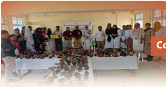
Community Hall, Buniyadabad

An Awareness-cum-Motivational Programme on PMEGP, Udyam Registration, NSWS, and other government schemes was organized by the District Industries Centre on June 6, 2025, at the Community Hall, Buniyadabad, in collaboration with the Industries Department, PRIs, and JSS-NGO.